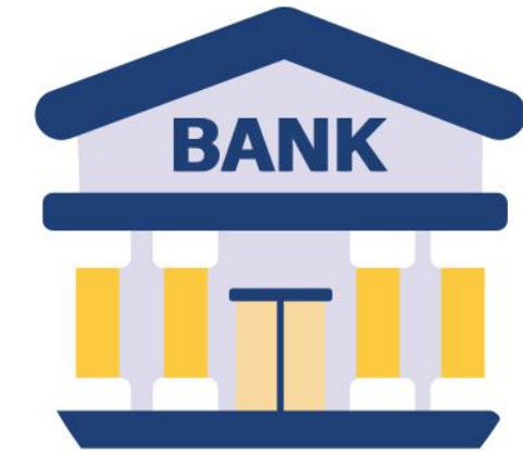
Simplified Forex Transactions