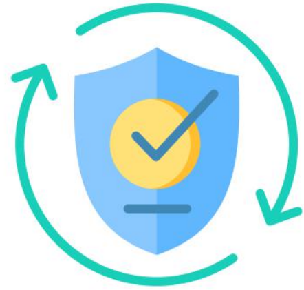
Easy Customs Clearance