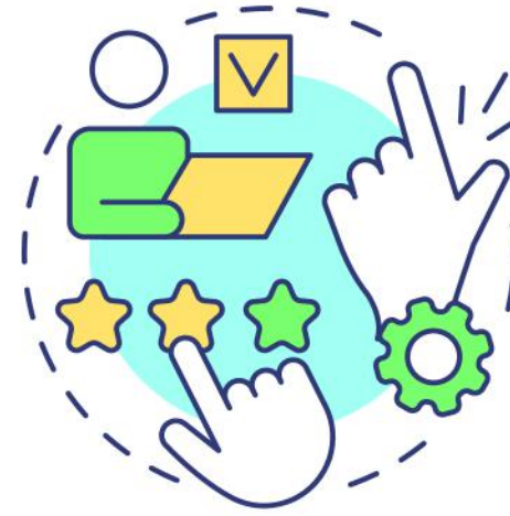
Ease of doing business