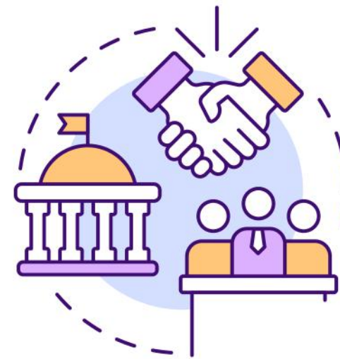
Access to the schemes of Govt.